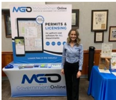
ETBO A Conference

Tabernacle Baptist Church Marriage Retreat was held here February 6-8. This group comes every year with about 150 attendees.