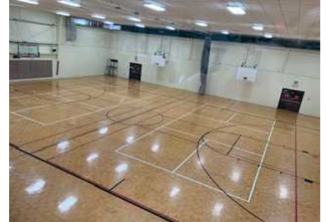
Pickleball Courts are now available