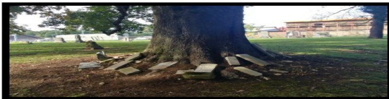
PICTURE OF HEADSTONE UNDER TREE WHERE THE TREE HAS GROWN AROUND THE HEADSTONE FOR MANY YEARS.