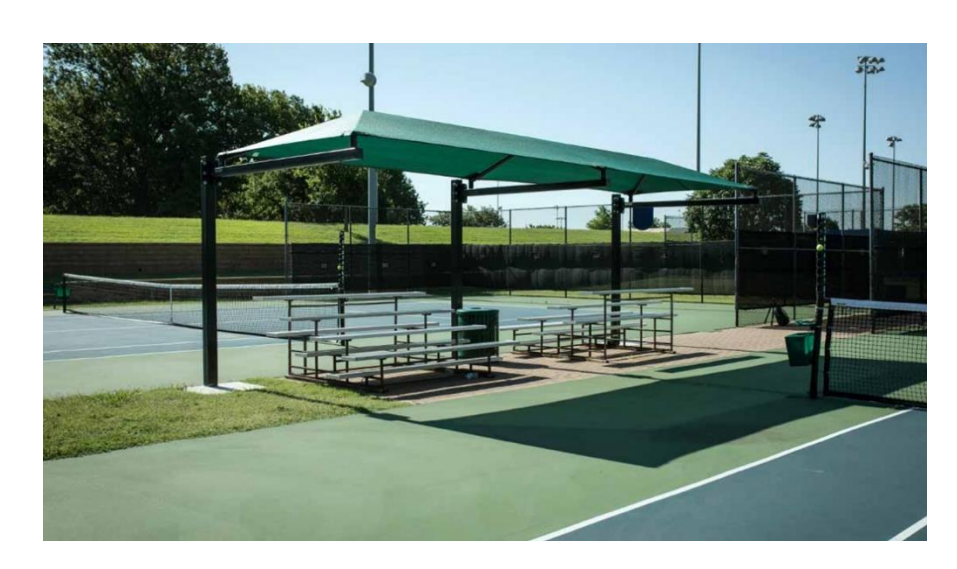
Example of Shade for Bleachers