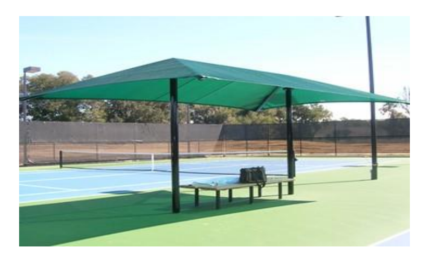
Example of Players Shade with Bench Seating