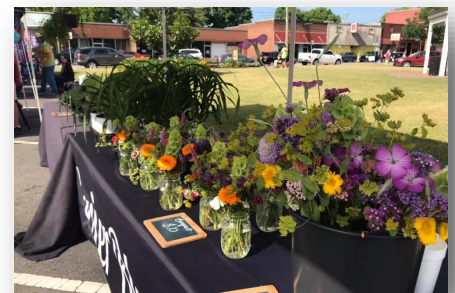
Sevier Blumen Booth at Farmer's Market