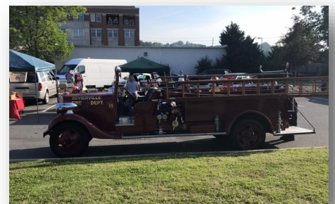
Vintage Sevierville Fire Truck at Farmer's Market