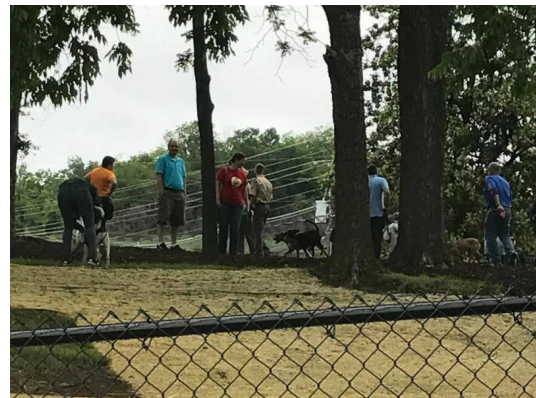
Residents and their pets enjoy the new dog park.

The dog park will be open 8AM-9PM daily April-October and 8AM-8PM November-March. The facility offers separate large and small dog areas, dog agility equipment, water, shade, observation cameras, Wi-Fi connectivity, benches and a designated parking/handicapped parking area. All pets must be vaccinated as required by City and State laws.