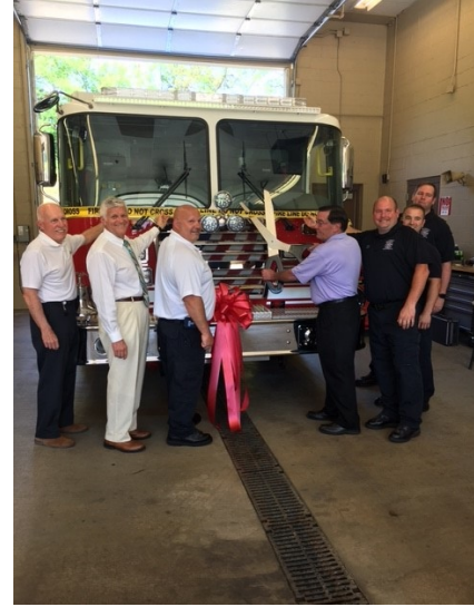
City officials and SFD Firefighters prepare for the ribbon cutting.

history. The last significant fire response for Engine 16 was the 2016 Gatlinburg area wildfires.