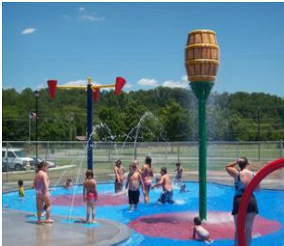
Family fun at the splash pad.

Its time for summer sun and fun at the Family Aquatic Center at City Park!