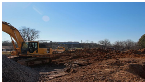
Site preparation for new main fire station.

The construction bidding process is expected to take place in early spring. The anticipated opening date is spring 2018.