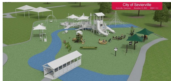
Conceptual rendering of new inclusive playground at City Park.

The City of Sevierville Department of Parks and Recreation, in partnership with PROJECT SEVIER, is rebuilding the Mt. Ton of Fun Playground at City Park. The City Public Works Department has removed the original playground and plans are being made to improve drainage before construction begins. PROJECT SEVIER is finalizing plans for a fundraising campaign that will begin this spring. Local contractor Charles Blalock and Sons, along with Vulcan Materials Company have offered assistance with site preparation for the new playground equipment. PROJECT SEVIER and the City will announce the anticipated opening date of the new all-inclusive playground in the near future.