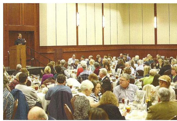
A large audience enjoys a speaker and lunch at the 2016 Rose Glen Literary Festival.

Sevierville's eighth annual Rose Glen Literary Festival will offer a venue for some of East Tennessee's best local writers to sell and sign books while also featuring new and innovative programming from prize-winning regional authors. The festival will take place Saturday, February 25, 2017, 9AM-3PM at the Sevierville Convention Center.