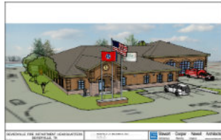
Conceptual drawing of new main fire station.

The Board of Mayor and Aldermen recently approved a 20 cent property tax increase to be used towards major improvements in City fire services. Plans are underway to build a new main fire station on Dolly Parton Parkway and renovate the 55-year old current main station downtown. Tax dollars will also be used to increase fire staff and purchase new equipment.