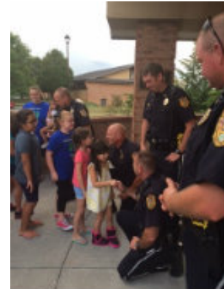
Celebrity Youth Theatre children visit SPD Officers.

Over the past year, organizations and individuals across our country have demonstrated their support for law enforcement. In Sevierville, we have seen a heartfelt outpouring of appreciation for our officers, especially during the last several weeks. We are so fortunate to be able work in an incredible community. You and your families mean everything to us, and to know that you stand with us strengthens our fortitude and reminds us of our ultimate purpose-to serve and protect you each and every day. We cannot thank everyone enough for all of your prayers, kind words, cards, messages and food.