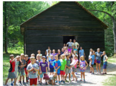
Summer Camp kids visit the Little Greenbrier Schoolhouse.